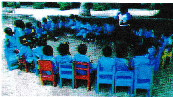
EEC Pupils receiving nonviolent lessons

Teachers in EEC have abandoned the whip without being told after observing the success of their pupils and students attained through the practice of Non-violent Communication, Attentive Listening, and Positive